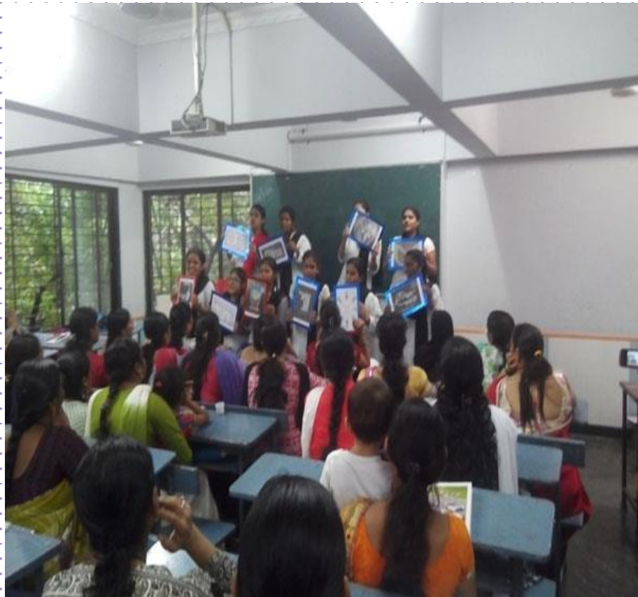
SKIT ON SOCIAL AWARENESS