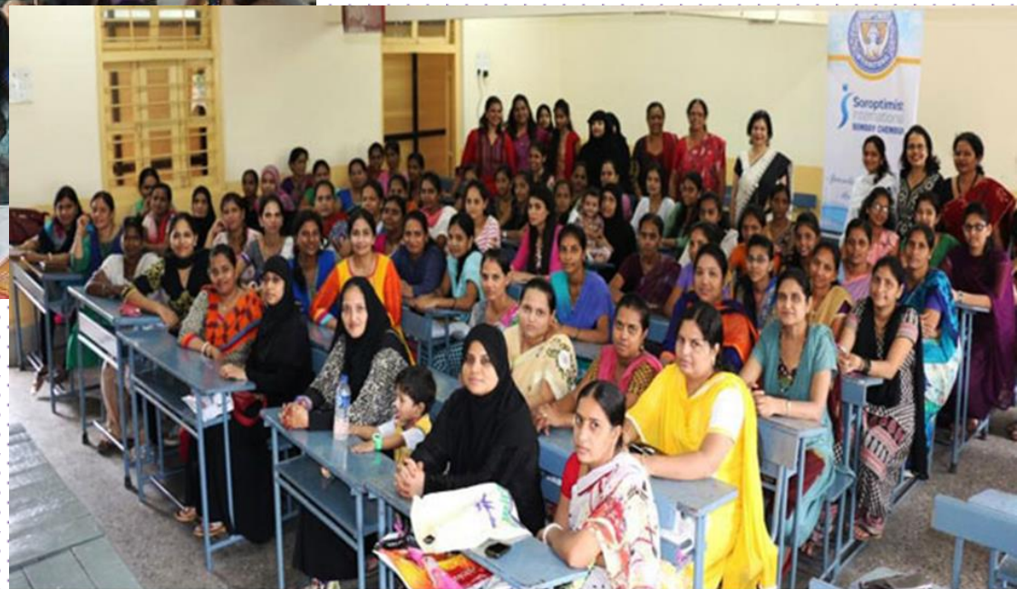
Adult literacy Programme 2016 - July 25-30 2016