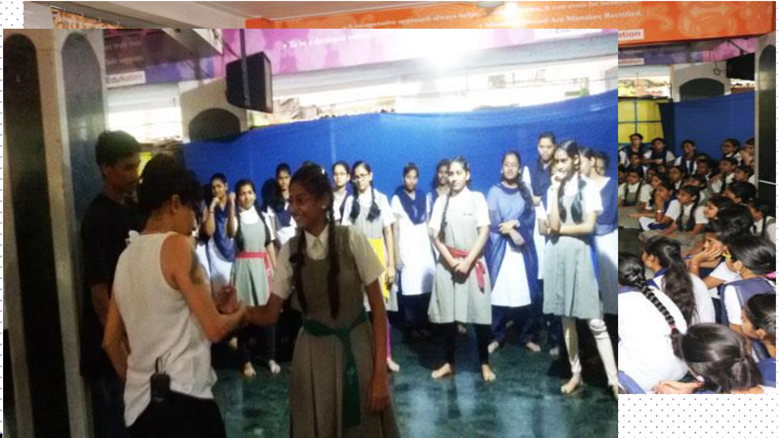
'Self Defence Workshop' for the girls of Grades 8 to 11