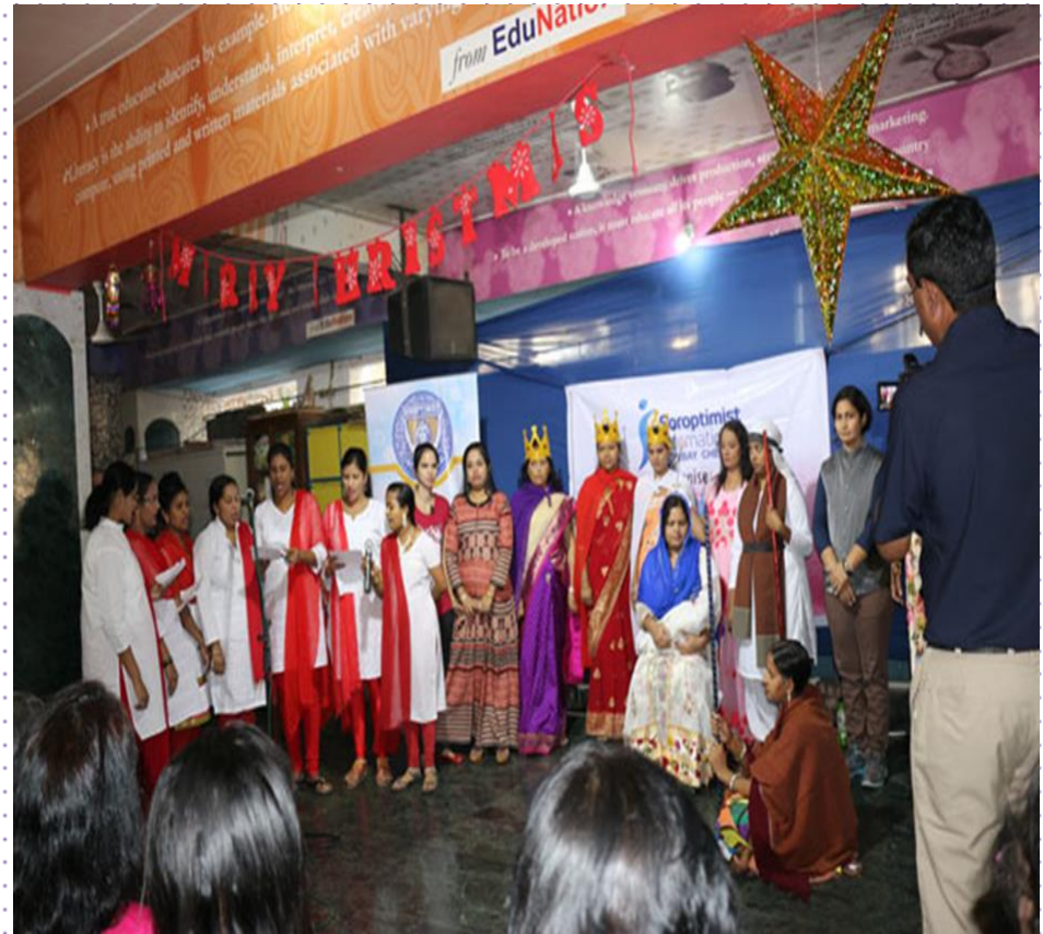
PLAY PRESENTED ON CHRISTMAS PARTY DEVELOPING CONFIDENCE