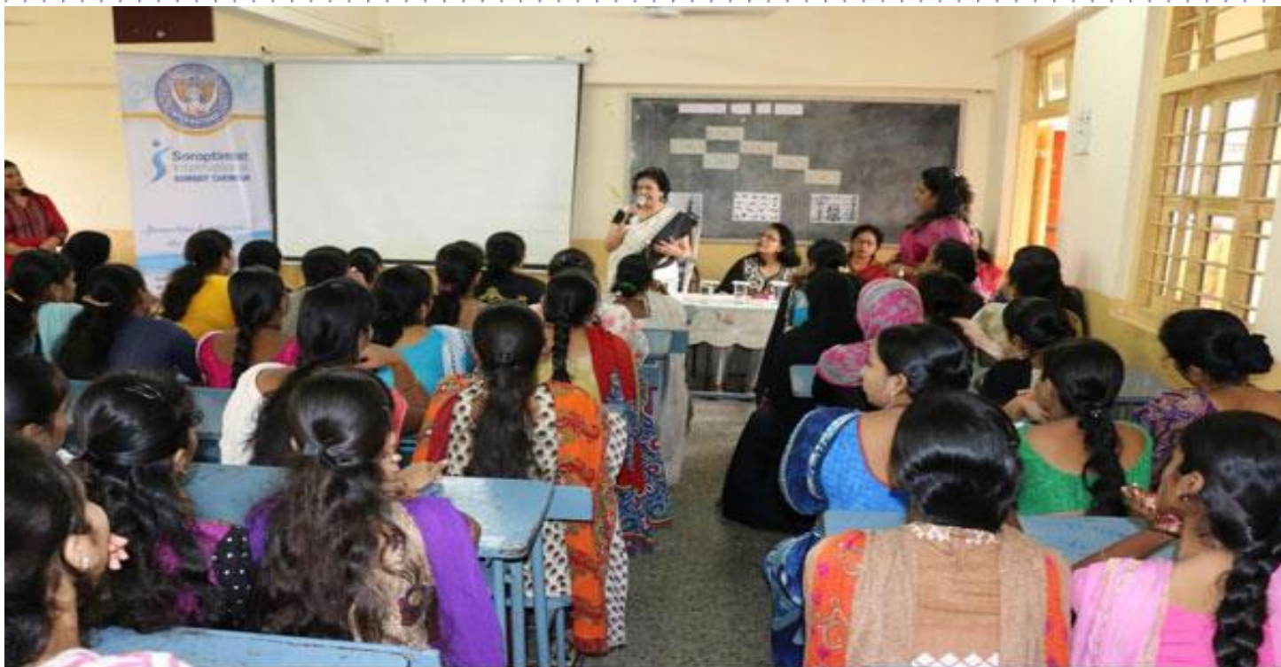
Adult literacy Programme 2016 - July 25-30 2016