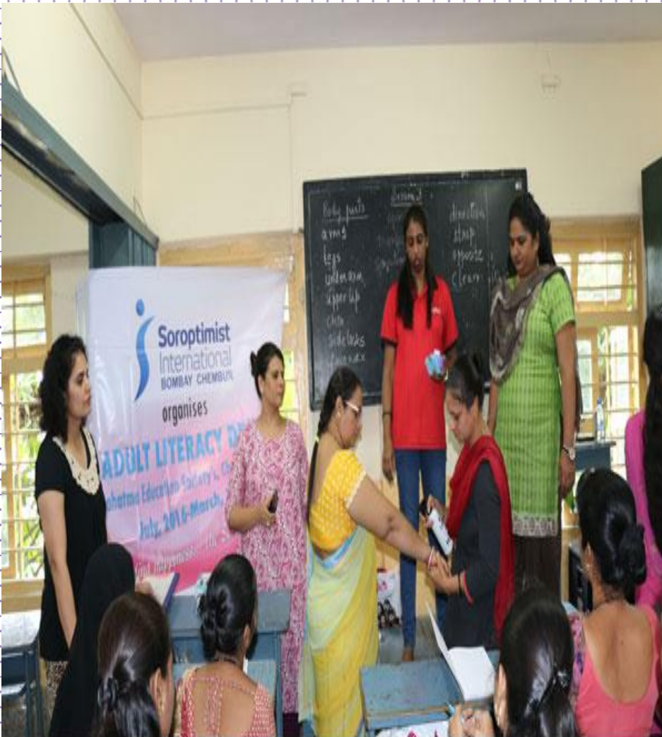
Week 3 - August 8-12, 2016 - Skill Development